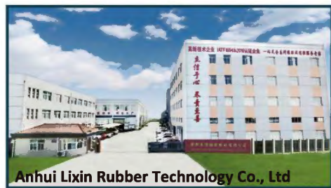
Anhui Lixin Rubber Technology Co., Ltd