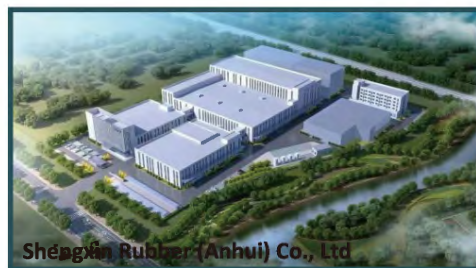
Shengxin Rubber (Anhui) Co., Ltd